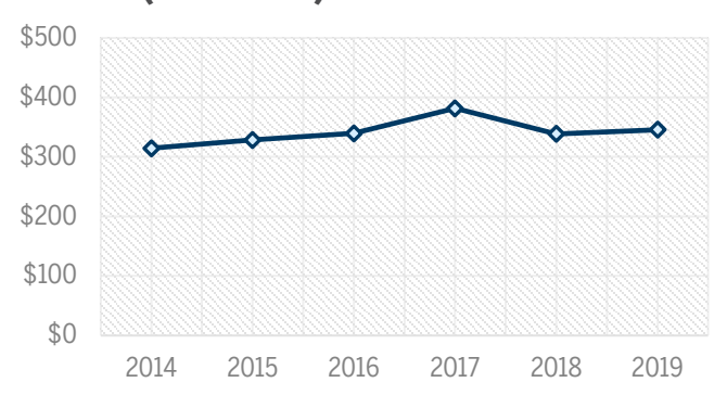
FIGURE 2. Total child care funding in Indiana in millions (2014–2019)<sup>28</sup>

In 2019, ELAC estimated that Indiana needed $1.1 billion to cover the funding for all children in poverty, leaving a funding shortfall of about $680 million. Despite increases in the Child Care and Development Block Grant (CCDBG) in the 2020 fiscal year budget and funding increases from the CARES Act, there is still vast unmet need in Indiana child care funding. At the national level, policy makers should consider increasing funds allocated to Head Start, as well as the CCDBG, particularly to account for the increases in compensation necessary to fund a high-quality ECE workforce. This gap could be one of the many factors that contribute to the several thousand children on waiting lists for CCDF vouchers in Indiana.