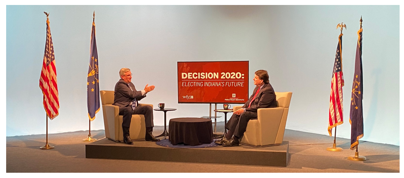
Indiana Gov. Eric Holcomb talks with former Indiana Supreme Court Chief Justice Randall Shepard during live taping of PPI's third gubernatorial forum. Shepard sat down with all three candidates for governor to discuss the most pressing issues facing Hoosiers as they headed to the polls.

punch cards in federal elections following the Florida recount controversy of 2000. However, concerns with these types of machines began to arise as early as the 2002 elections. The 2019 Indiana lawsuit cited the use of paperless electronic voting machines leaves Indiana vulnerable to security risks. PPI researchers examined data from the organization Verified Voting to review the prevalence and types of voting equipment used in Indiana polling sites as of 2020. Nearly 60% of Indiana's voting machines are paperless, and the Hoosier state was only one of eight states that used paperless voting machines in the November 2020 election.