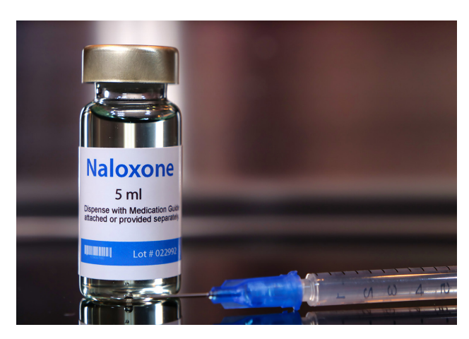
Naloxone is a medicine that rapidly reverses an opioid overdose. It can quickly restore normal breathing to a person if their breathing has slowed or stopped because of an opioid overdose.